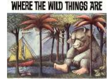
STORY AND PICTURES BY MAURICE SENDAK