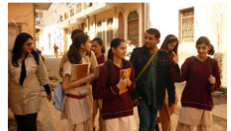
Class 9 visiting Kishangarh (Mehrauli) Village on Saturday, the 5 th of February.