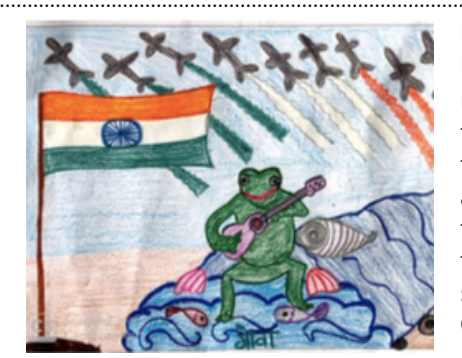
I watched the Republic Day Parade and loved the tableaux on the state of Goa as it depicted the save the frog campaign started by the Government of