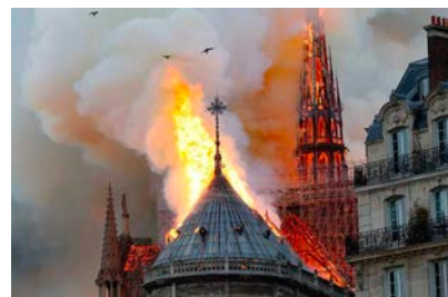
the burning Notre -Dame