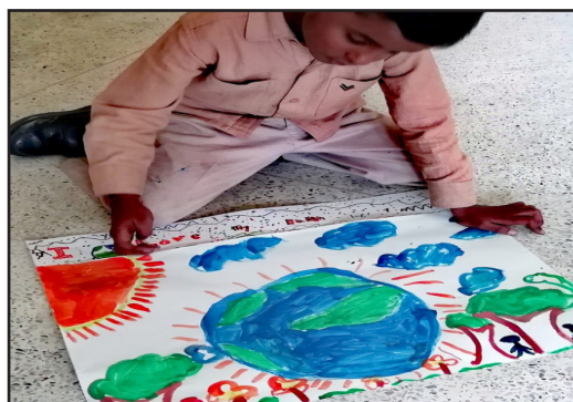
Commemorating Earth Day Class I