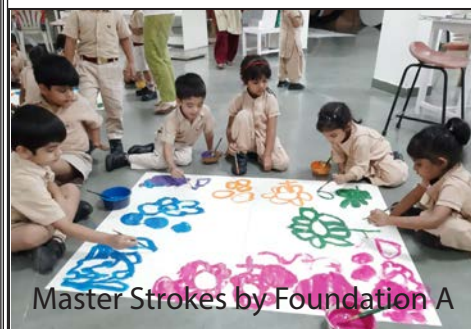
Master Strokes by Foundation A